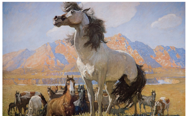
Professional Artist Example: NC Wyeth

Artistic Literacy: Quality of Critical Response