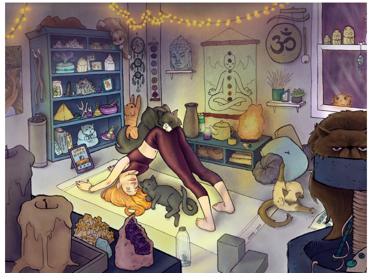
Professional Artist Example: Erin Zerbe-Comer

Communication: Application of Disciplinary Conventions