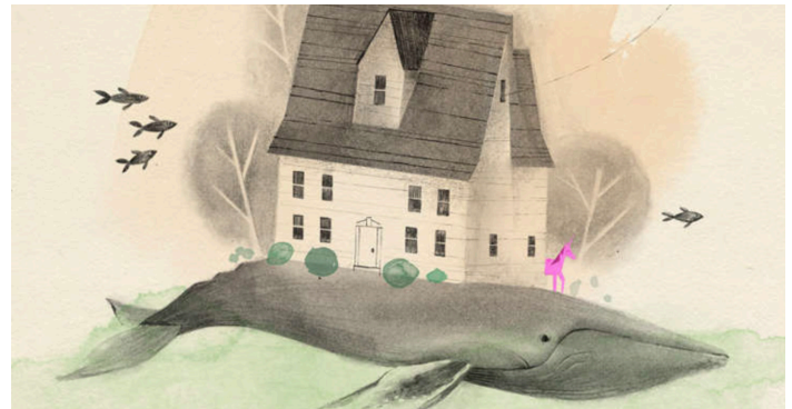
Master Copy Example: Kenard Pak